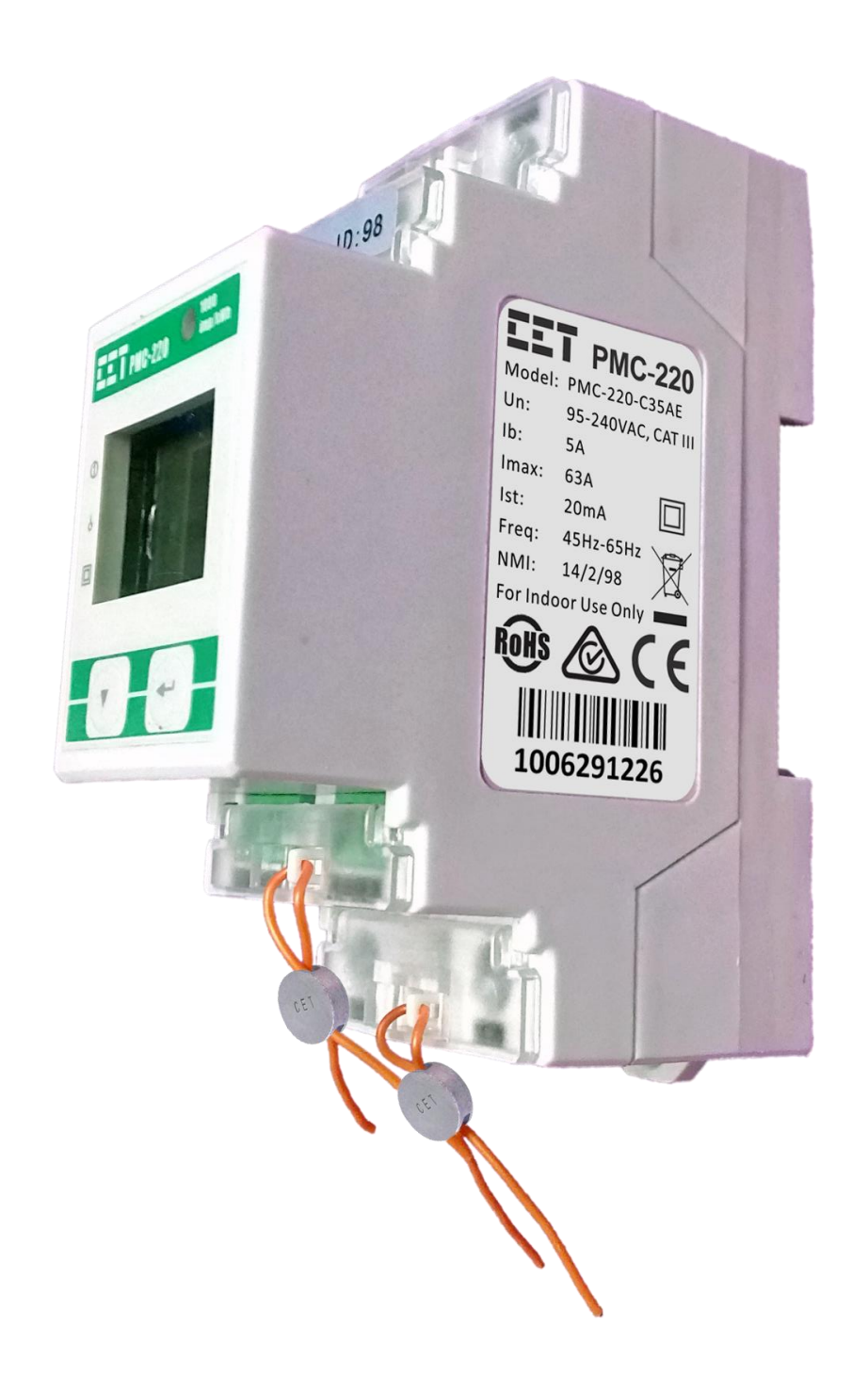
CET ELECTRIC TECHNOLOGY INC. model CET PMC-220-C35AE Electricity Meter Showing Markings