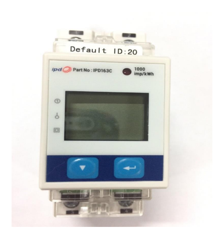
Variant 1 - CET ELECTRIC TECHNOLOGY INC. model IPD 163C Electricity Meter