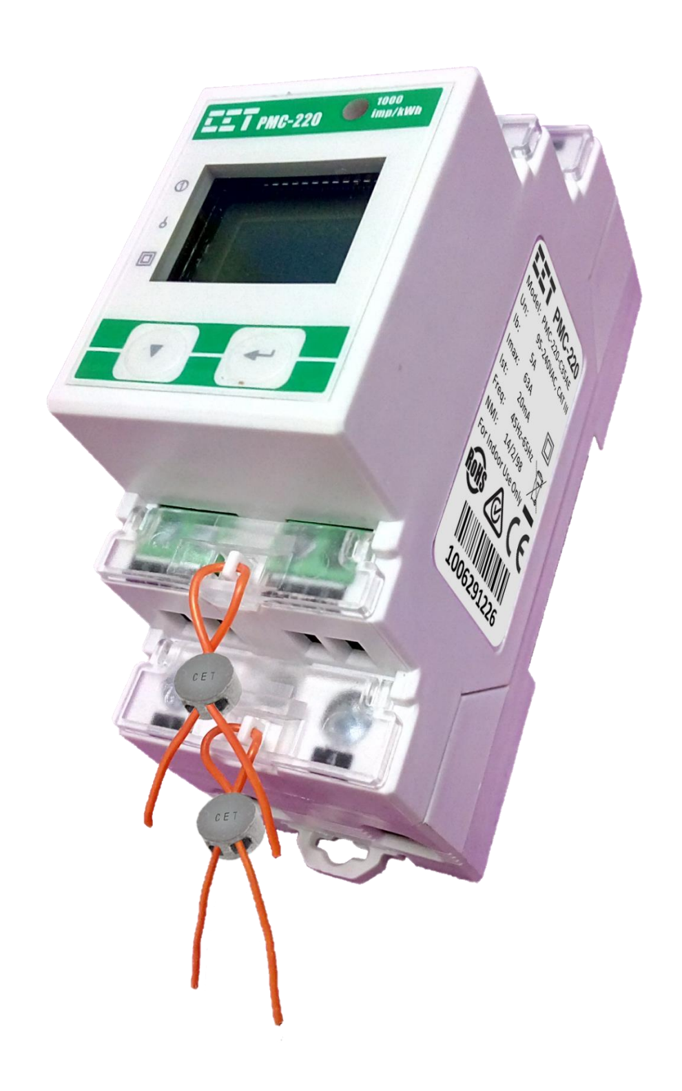
CET ELECTRIC TECHNOLOGY INC. model CET PMC-220-C35AE Electricity Meter Including Typical Mechanical Sealing